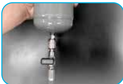
Turning upside down