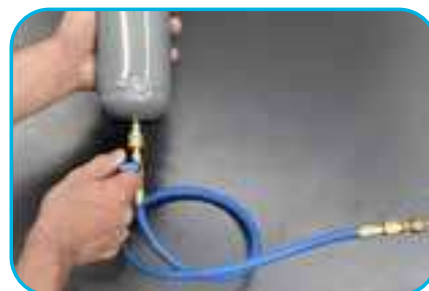
Flushing and fluxing