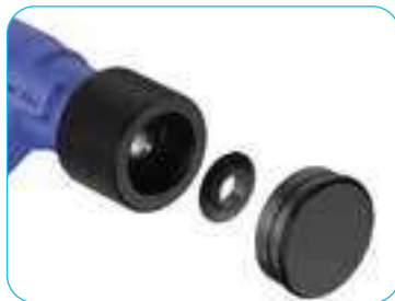
Spare blade included